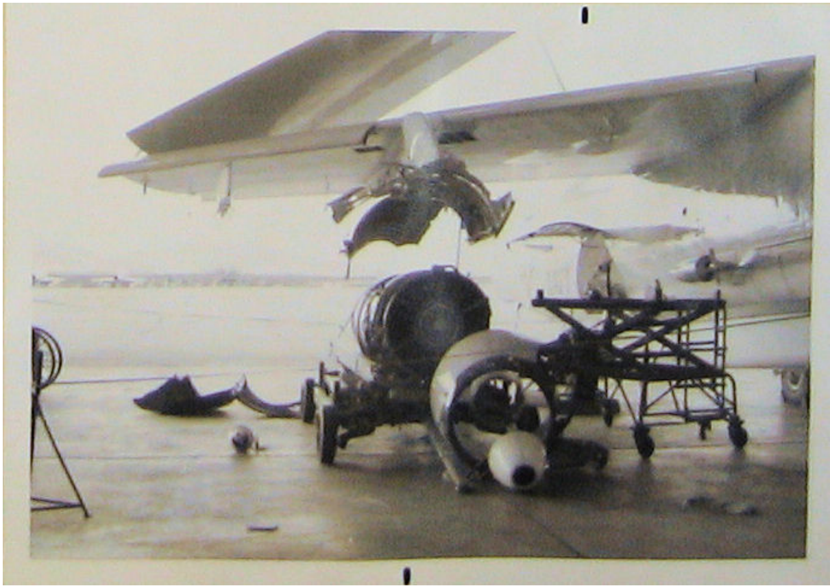
Engine damage photo #1